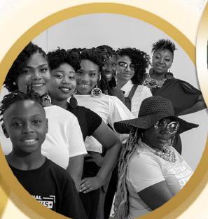
AFRO DEZIAC NATURAL HAIR & SPA