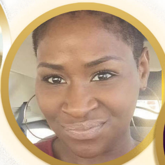
THE SALON PITT