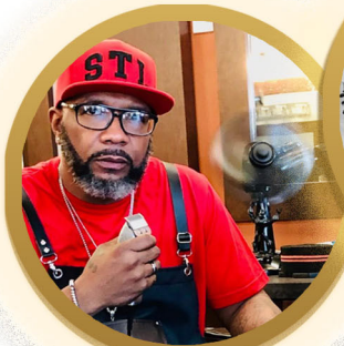
"O" THE BARBER BIG TYMERS BARBER BIG TYMERS HAIR SALON